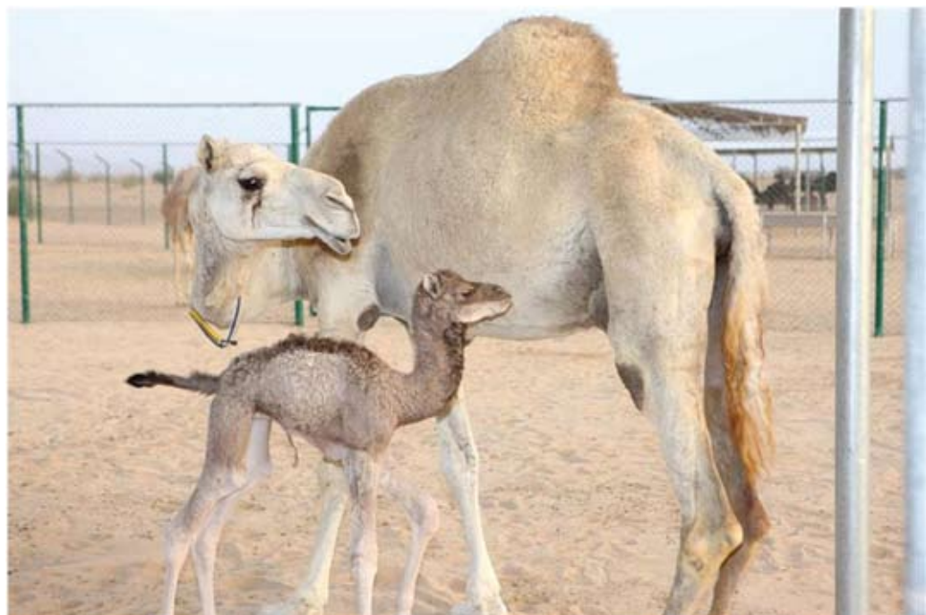
ولادة أول جمل مستنسخ في العالم في دبي يوم الخميس 8 أبريل 2009 Birth of the the world's first cloned camel in Dubai on Thursday 8 April, 2009