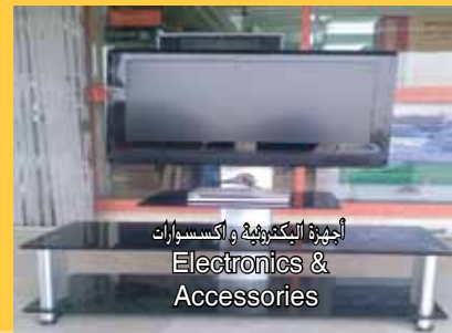
أجهزة إلكترونية وإكسسوارات Electronics & Accessories