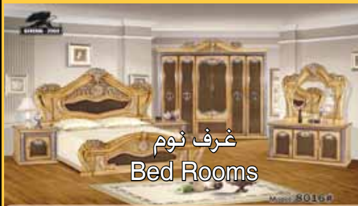
غرف نوم Bed Rooms