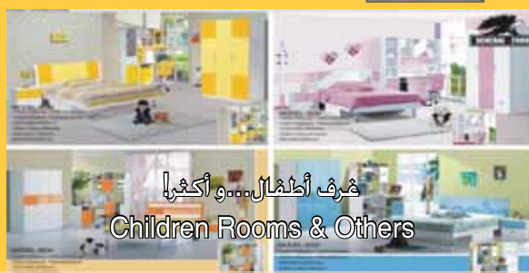
غرف أطفال... وأكثر Children Rooms & Others