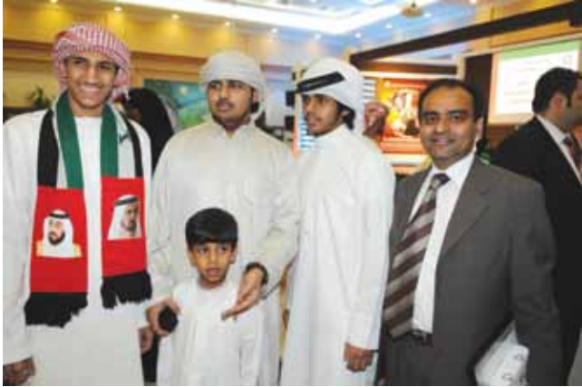
Al Ain Times News:

Ayla Hotel was among the sponsors for the National Day celebrations at the Higher Colleges of Technology for Men and Women that took place in