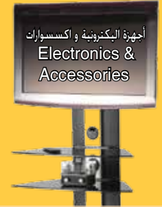
أجهزة إلكترونية وإكسسوارات Electronics & Accessories

Tel: +971 3 7815908 Fax: +971 3 7815990 alamergeneral2000@yahoo.com - alamergeneral2000@hotmail.com www.alamer-general2000.com