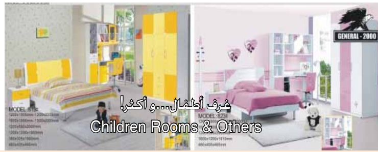
غرف أطفال... وأكثر Children Rooms & Others