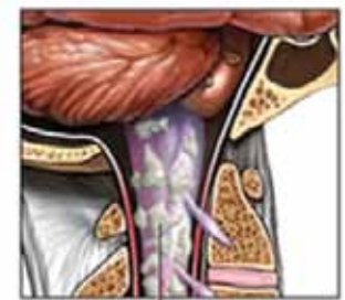
Areas of plaque surround the spinal cord

and signs, the MRI which is a special imaging called magnetic resonance available in all major hospitals, and special electro diagnostic test, and special test from the spinal fluid.