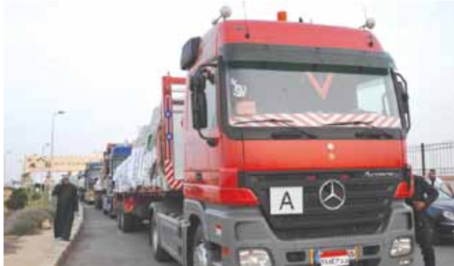
bin Rashid Al Maktoum.