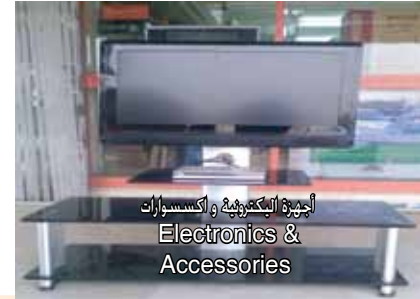
أجهزة إلكترونية واكسسوارات Electronics & Accessories