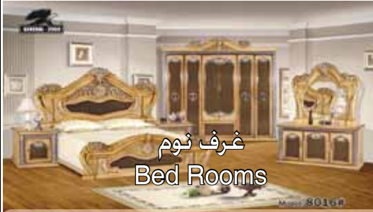
غرف نوم Bed Rooms