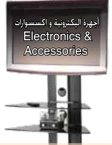
أجهزة إلكترونية واكسسوارات Electronics & Accessories

Tel: +971 3 7815908 Fax: +971 3 7815990 alamergeneral2000@yahoo.com - alamergeneral2000@hotmail.com www.alamer-general2000.com