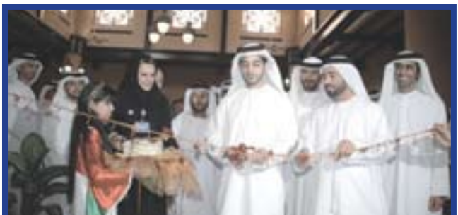
Sheikh Hazza Bin Tahnoon Al-Nahyan Inaugrates Souk Al Zafrana In Al-Ain