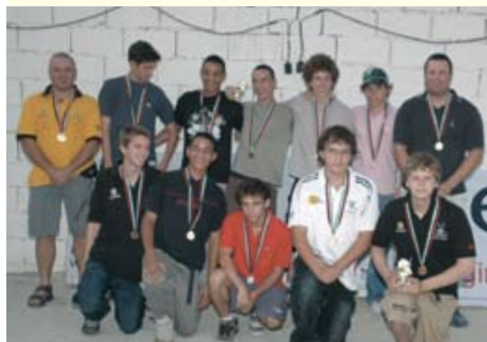
Some of the many prize winners