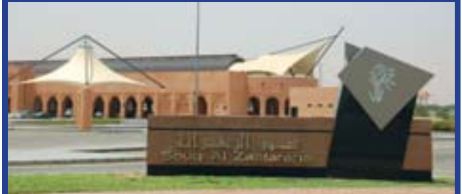
Built in a traditional style, Souk Al Zafrana is a unique experience. The souk includes grocery, clothes outlets and is soon to have a food court.