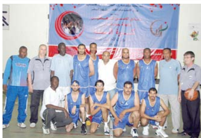
Al-Ain Disable Club Basket ball Ramadan Tournament