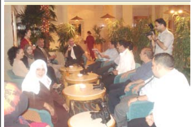
The Al Ain Rotana Hotel recently hosted an Iftar buffet for local journalists and media role players.