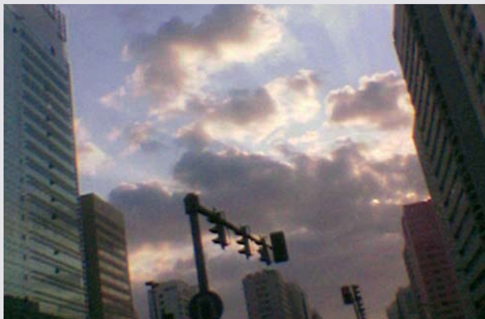
Abu Dhabi at Dusk