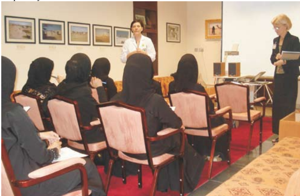
Social Work students are introduced to the background and history of Oasis Hospital